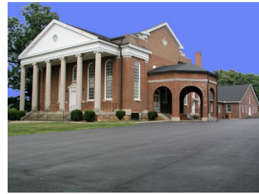
Old Providence ARP Church